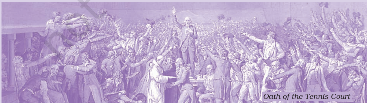
Oath of the Tennis Court

CONSTITUENT ASSEMBLY DEBATES (CAD), VOL. I