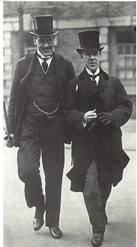
Fig. 15.7 Edwin Montague (left) was the author of the Montague-Chelmsford Reforms of 1919 which allowed some form of representation in provincial legislative assemblies.

➤ Why does the speaker in Source 2 think that the Constituent Assembly was under the shadow of British guns?