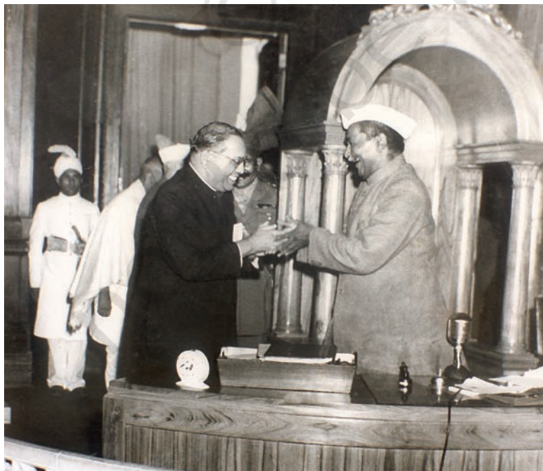
Fig. 15. 9 B. R. Ambedkar and Rajendra Prasad greeting each other at the time of the handing over of the Constitution

The Constituent Assembly debates help us understand the many conflicting voices that had to be negotiated in framing the Constitution, and the many demands that were articulated. They tell us about the ideals that were invoked and the principles that the makers of the Constitution operated with. But in reading these debates we need to be aware that the ideals invoked were very often re-worked according to what seemed appropriate within a context. At times the members of the Assembly also changed their ideas as the debate unfolded over three years. Hearing others argue, some members rethought their positions, opening their minds to contrary views, while others changed their views in reaction to the events around.