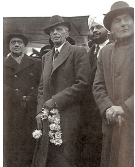
Fig. 15.8 In the winter of 1946 Indian leaders went to London for what turned out to be a fruitless round of talks with British Prime Minister Attlee. (Left to right: Liaquat Ali, Mohammad Ali Jinnah, Baldev Singh and Pethick-Lawrence)