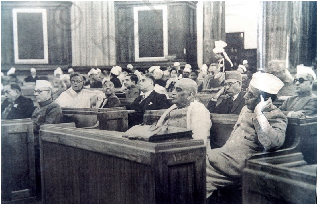
Fig. 15.4 The Constituent Assembly in session Sardar Vallabh Bhai Patel is seen sitting second from right.

The discussions within the Constituent Assembly were also influenced by the opinions expressed by the public. As the deliberations continued, the arguments were reported in newspapers, and the proposals were publicly debated. Criticisms and