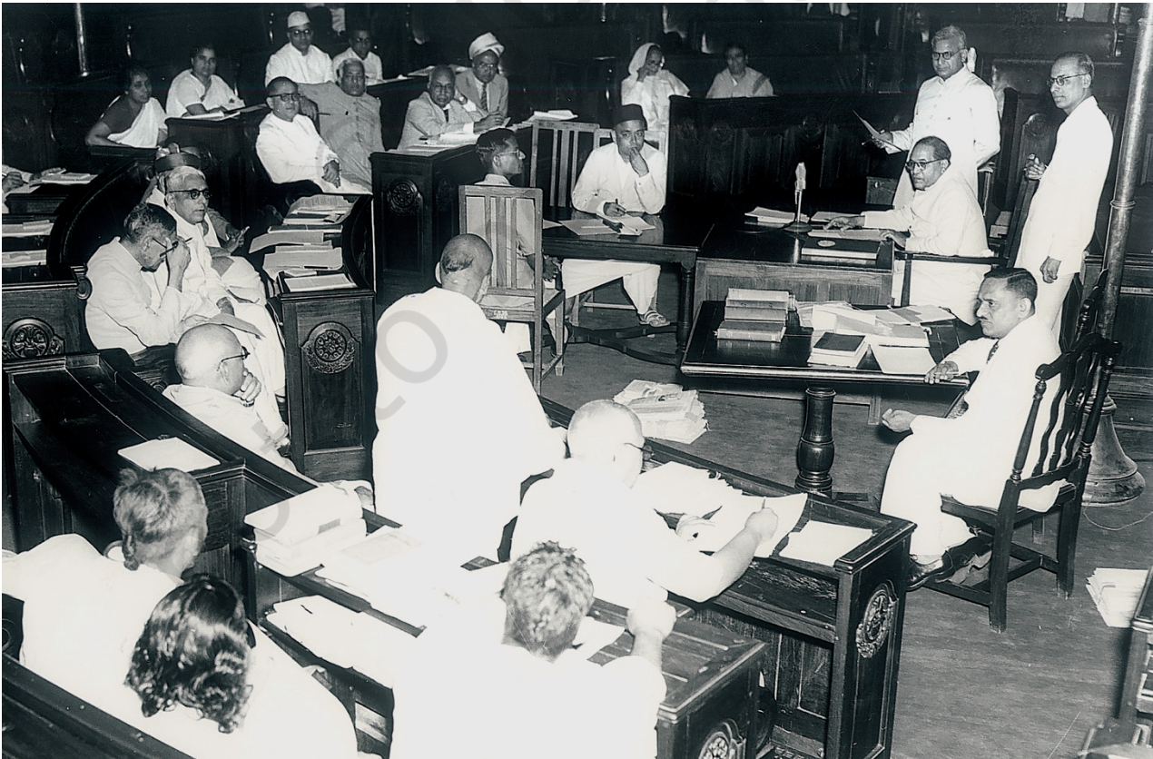
Fig. 15.5 B. R. Ambedkar presiding over a discussion of the Hindu Code Bill

Look again at Chapters 13 and 14. Discuss how the political situation of the time may have shaped the nature of the debates within the Constituent Assembly.