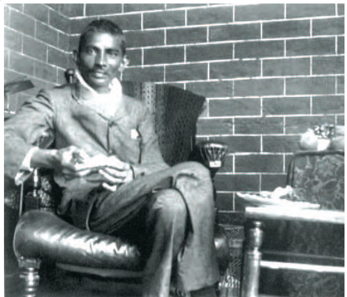
Fig. 11.2 Mahatma Gandhi in Johannesburg, South Africa, February 1908

On Gokhale’s advice, Gandhiji spent a year travelling around British India, getting to know the land and its peoples. His first major public appearance was at the opening of the Banaras Hindu University (BHU) in February 1916. Among the invitees to