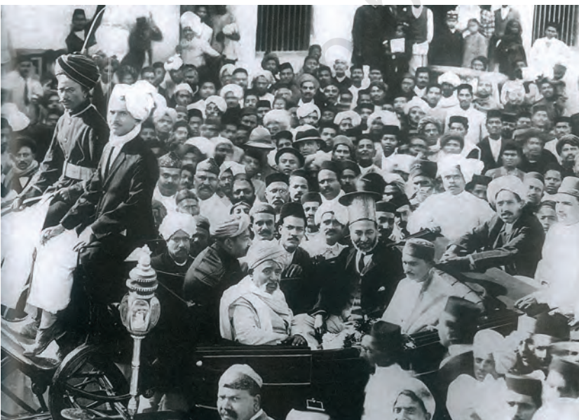
Fig. 11.3 Mahatma Gandhi in Karachi, March 1916

Gandhiji’s speech at Banaras in February 1916 was, at one level, merely a statement of fact – namely, that Indian nationalism was an elite phenomenon, a creation of lawyers and doctors and landlords. But, at another level, it was also a statement of intent – the first public announcement of Gandhiji’s own desire to make Indian nationalism more properly