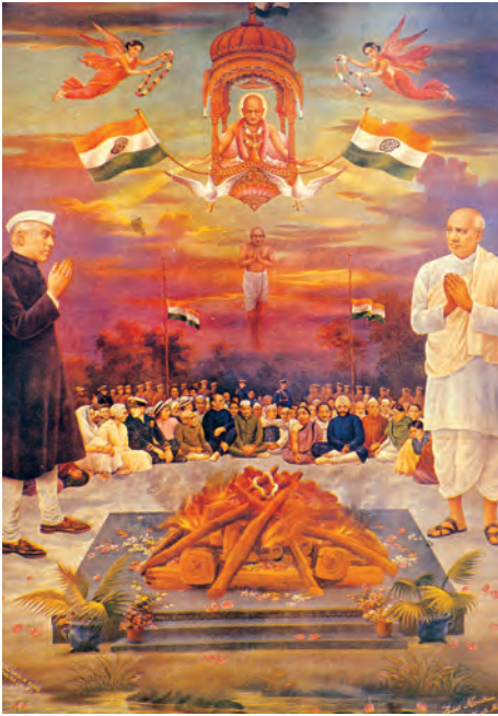
Fig. 11.15 The death of the Mahatma, a popular print

In popular representations, Mahatma Gandhi was deified, and shown as the unifying force within the national movement. Here you can see Jawaharlal Nehru and Sardar Patel, representing two strands within the Congress, standing on two sides of Gandhi's pyre. Blessing them both from a heavenly realm, is Mahatma Gandhi, at the centre.