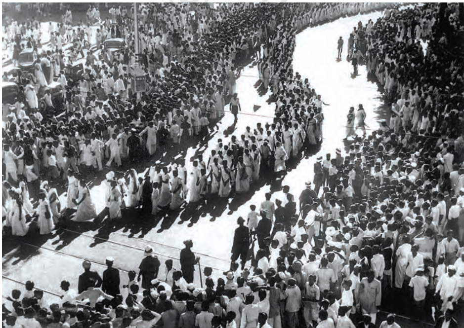
Fig. 11.12 Women’s procession in Bombay during the Quit India Movement

In 1943, some of the younger leaders in the Satara district of Maharashtra set up a parallel government ( prati sarkar ), with volunteer corps ( seba dals ) and village units ( tufan dals ). They ran people’s courts and organised constructive work. Dominated by kunbi peasants and supported by dalits, the Satara prati sarkar functioned till the elections of 1946, despite government repression and, in the later stages, Congress disapproval.