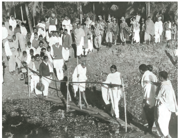
Fig. 11.14 On the way to a riot-torn village, 1947