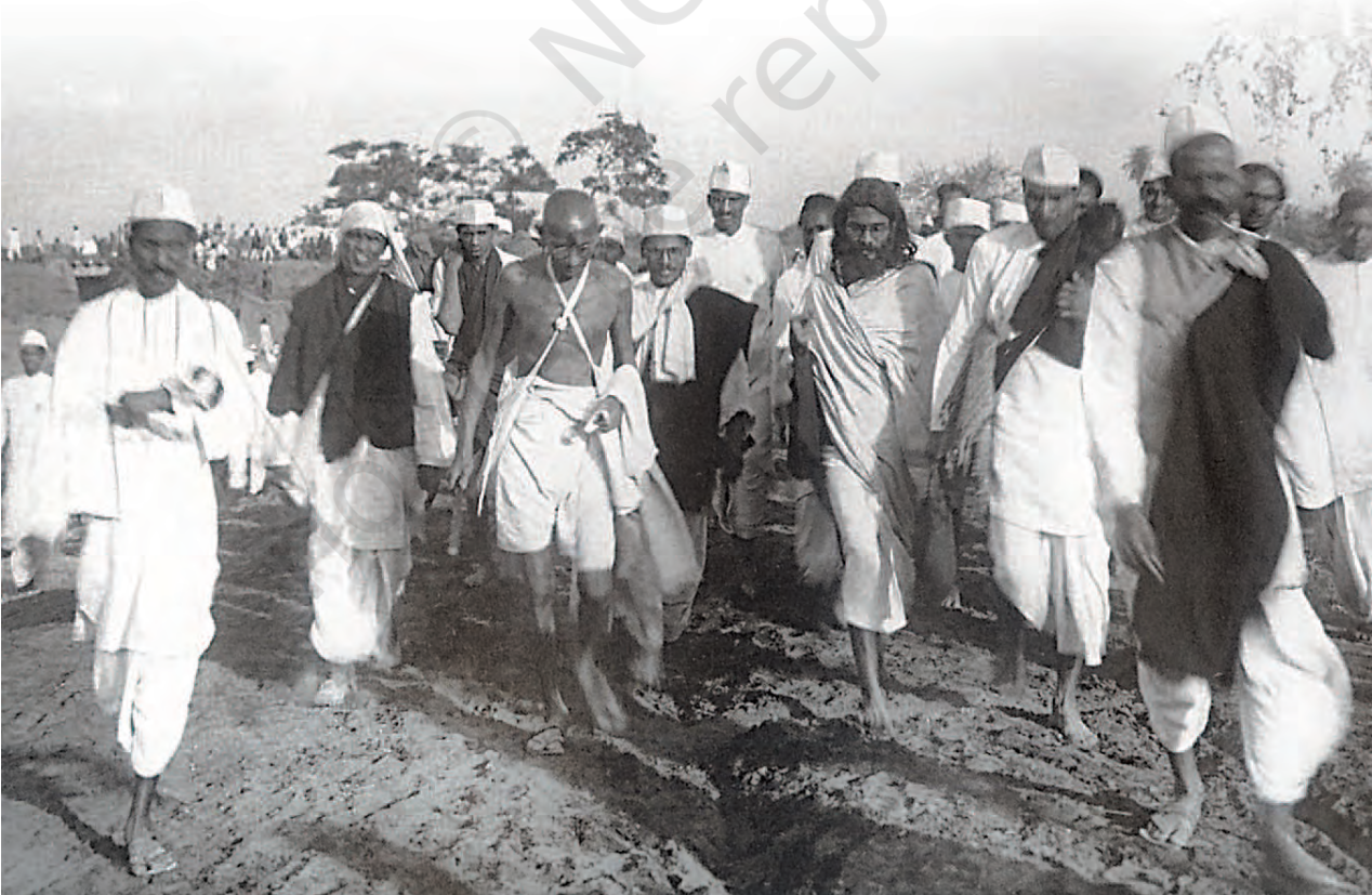
Fig. 11.6 On the Dandi March, March 1930

Soon after the observance of this “Independence Day”, Mahatma Gandhi announced that he would lead a march to break one of the most widely disliked laws in British India, which gave the state a monopoly in the manufacture and sale of salt. His picking on the salt monopoly was another illustration of Gandhiji’s tactical wisdom. For in every Indian household, salt was indispensable; yet people were forbidden from making salt even for domestic use, compelling them to buy it from shops at a high price. The state monopoly over salt was deeply unpopular; by making it his target, Gandhiji hoped to mobilise a wider discontent against British rule.