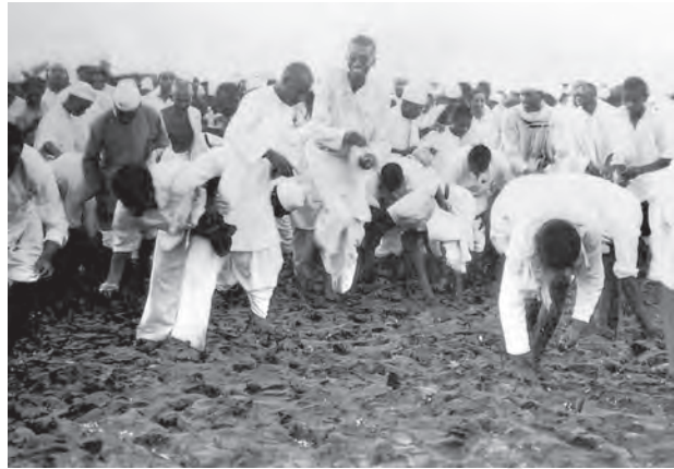
Fig. 11.7 Satyagrahis picking up natural salt at the end of the Dandi March, 6 April 1930

Where most Indians understood the significance of Gandhiji's challenge, the British Raj apparently did not. Although Gandhiji had given advance notice of his "Salt March" to the Viceroy Lord Irwin, Irwin failed to grasp the significance of the action. On 12 March 1930, Gandhiji began walking from his ashram at Sabarmati towards the ocean. He reached his destination three weeks later, making a fistful of salt as he did and thereby making himself a criminal in the eyes of the law. Meanwhile, parallel salt marches were being conducted in other parts of the country.