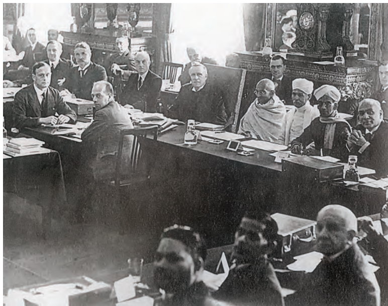
Fig. 11.9 At the Second Round Table Conference, London, November 1931 Mahatma Gandhi opposed the demand for separate electorates for “lower castes”. He believed that this would prevent their integration into mainstream society and permanently segregate them from other caste Hindus.

letter to his sister, Willingdon wrote: “It’s a beautiful world if it wasn’t for Gandhi ... At the bottom of every move he makes which he always says is inspired by God, one discovers the political manouevre. I see the American Press is saying what a wonderful man he is ... But the fact is that we live in the midst of very unpractical, mystical, and superstitious folk who look upon Gandhi as something holy, ...”