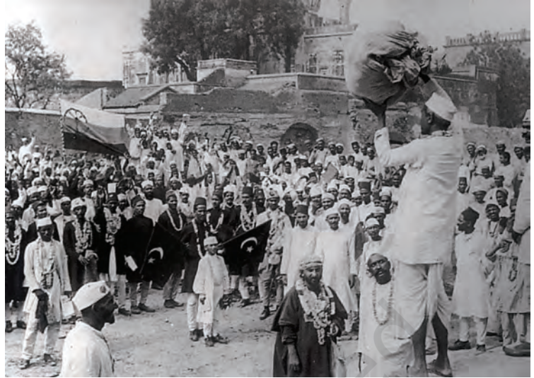
Fig. 11.4 Non-cooperation Movement, July 1922

By 1922, Gandhiji had transformed Indian nationalism, thereby redeeming the promise he made in his BHU speech of February 1916. It was no longer a movement of professionals and intellectuals; now, hundreds of thousands of peasants, workers and artisans also participated in it. Many of them venerated Gandhiji, referring to him as their