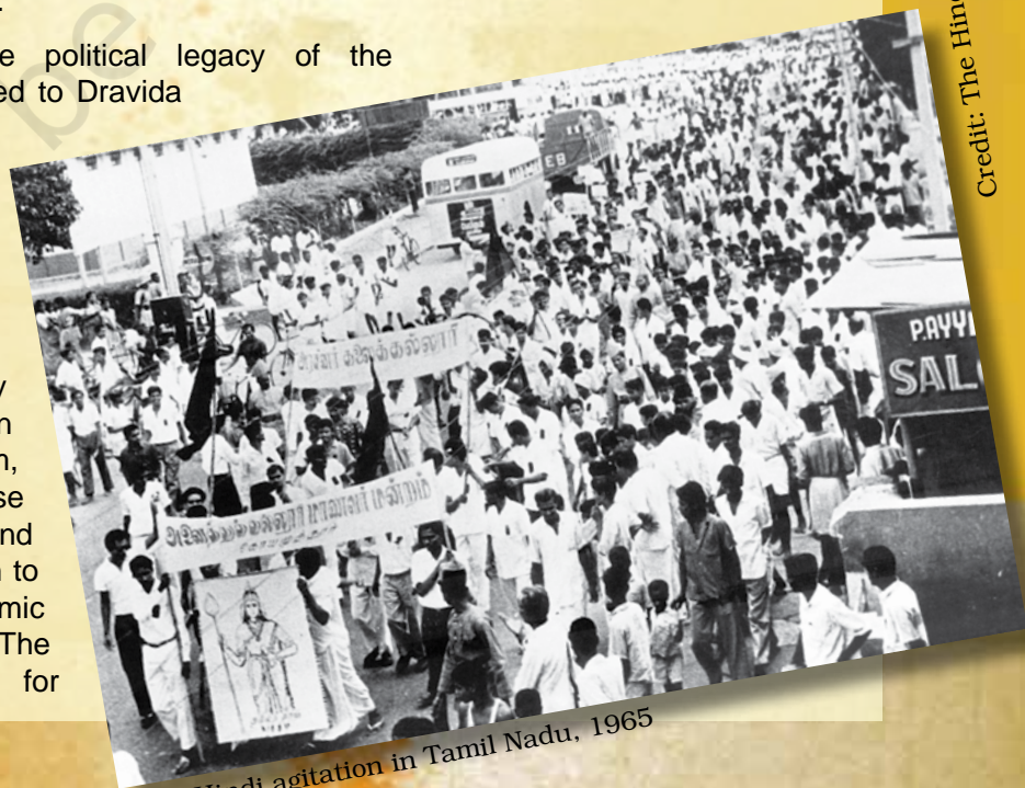
Anti-Hindi agitation in Tamil Nadu, 1965

The DK split and the political legacy of the movement was transferred to Dravida Munnetra Kazhagam (DMK). The DMK made its entry into politics with a three pronged agitation in 1953-54. First, it demanded the restoration of the original name of Kallakudi railway station which had been renamed Dalmiapuram, after an industrial house from the North. This demand brought out its opposition to the North Indian economic and cultural symbols. The second agitation was for