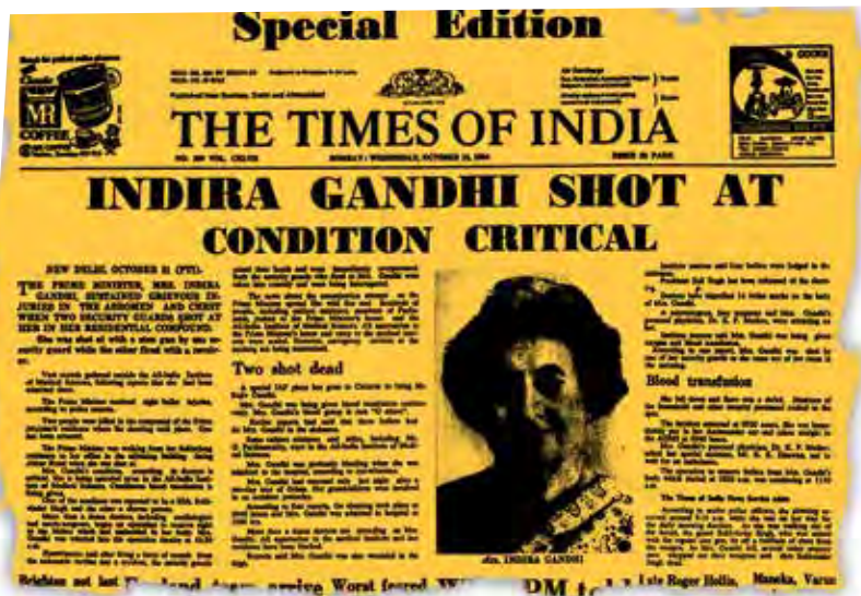
The Times of India brought out a special mid-day edition on the day Indira Gandhi was assassinated.