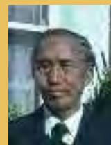
Angami Zapu Phizo

Assam accord brought peace and changed the face of politics in Assam, but it did not solve the problem of immigration. The issue of the 'outsiders' continues to be a live issue in the politics of Assam