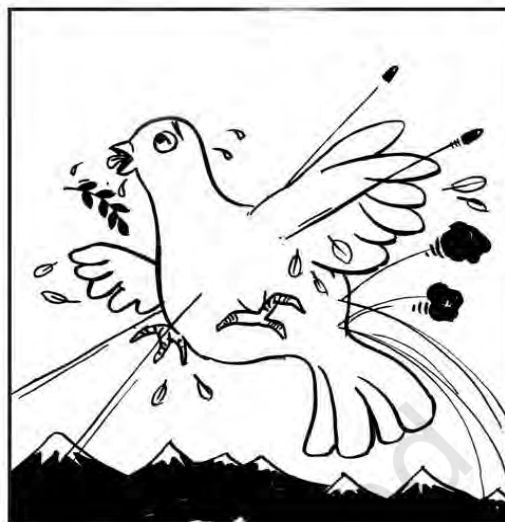
Peace in Kashmir

Separatist politics which surfaced in Kashmir from 1989 has taken different forms and is made up of various strands. There is one strand