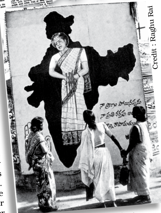
Women looking at a wall painting depicting Indira Gandhi's assassination.

for almost a week. More than two thousand Sikhs were killed in the national capital, the area worst affected by this violence. Hundreds of Sikhs were killed in other parts of the country, especially in places like Kanpur, Bokaro and Chas. Many Sikh families lost their male members and thus suffered great emotional and heavy financial loss. What hurt the Sikhs most was that the government took a long time in restoring normalcy and that the perpetrators of this violence were not effectively punished. Twenty years later, speaking in the Parliament in 2005, Prime Minister Manmohan Singh expressed regret over these killings and apologised to the nation for the anti-Sikh violence.